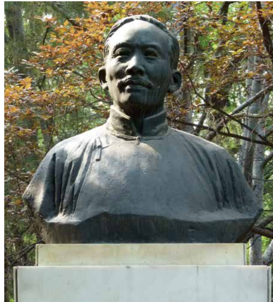
CAI Yuanpei was appointed the President in 1917.